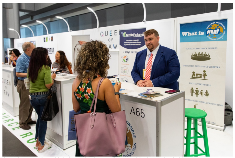
Attendees meeting with industry leaders to discuss ethical sourcing habits.

Taking a walk down Resource Row led attendees to a slew of companies sharing their industry tools including trend consultants, fabric recycling companies, technology, fashion consulting, creative learning, workshops, networking and more.