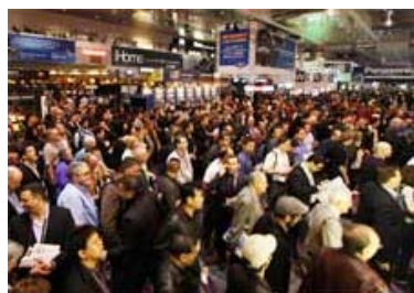
Attendees rush into the central hall from the grand lobby at the 2011 International CES.

The anonymous quote, statistics can be made to prove anything, could easily be applied to the tradeshow industry in the early months of 2011. Could attendance numbers from a few random conventions signal a rebound for the industry? The answer: Either the U.S. population is showing an enhanced interest in poultry, Macintosh computers and textiles, or the tradeshow industry is off to an excellent start in 2011.