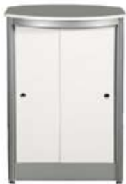
1M Information Counter