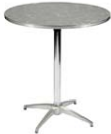
Pedestal Table 30" High Color: Aluminum