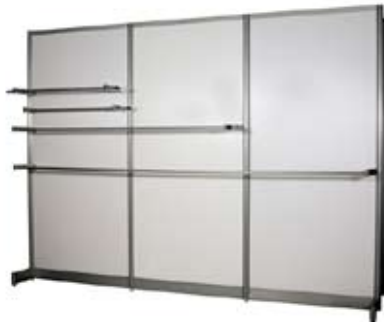
1M, 2M or 3M Chrome Display Racks 12" off wall