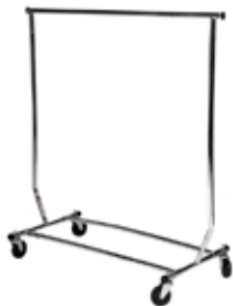
Chrome Rolling Rack