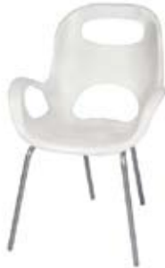
Designer Arm Chair